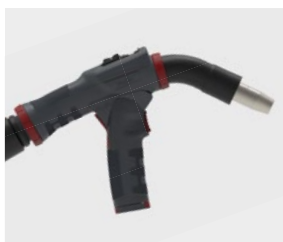
Pistol grip (can be assembled and disassembled without tools)