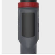
With cap as standard