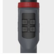
2 U/D, 2U/DX