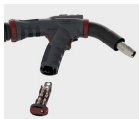
Pistol grip with integrated magazine for storing torch key and two contact tips each