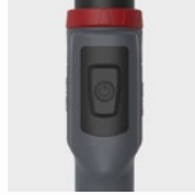
Torch trigger at the top