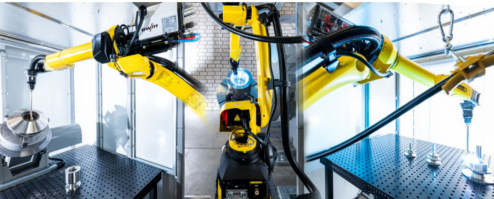
Arrangement of the three work areas of the robot: the large L-positioner with tilting function for the large valve bodies on the left, one small turning/tilting positioner on a system bench for the small valve bodies in the middle, and a third station with a system bench without positioners for any other components.