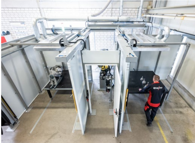
Confined spaces in the design of the robot system with three processing stations

The robot was fitted in an extremely small booth in the centre between the three stations. This booth also includes both the power source and a Titan XQ. These are positioned behind the L-positioner at the large processing station. The Rob 5 drive 4X wire feeder mounted on the robot arm ensures secure wire feeding. Access to the Fanuc Arc Mate 100 iD in all three stations at all necessary positions is also ensured thanks to the extreme arm length of two metres and optimised space inside the booths.