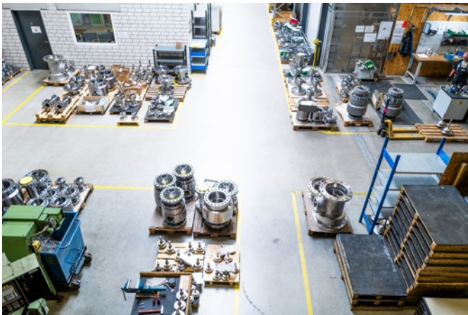
Schroeder Valves' range of parts is distinguished by its various components and component sizes.